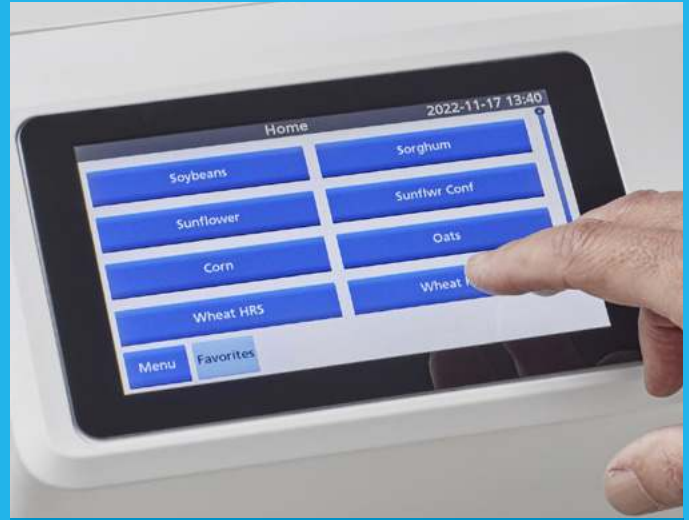
LARGE COLOR TOUCHSCREEN WITH INTUITIVE USER INTERFACE