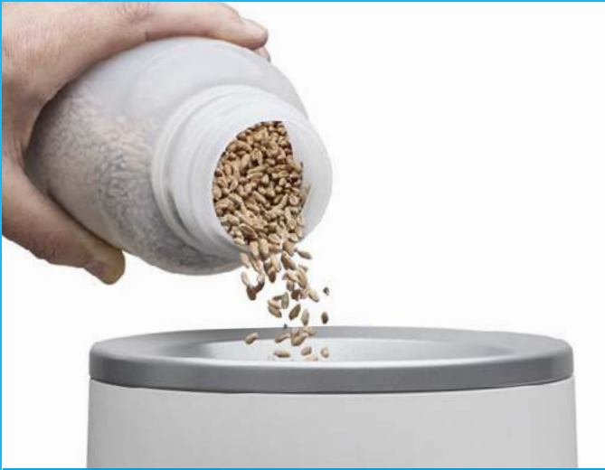
AUTOMATIC ANALYSIS WITH UGMA TECHNOLOGY