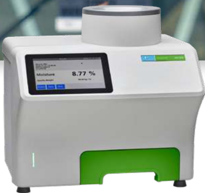
Aquamatic 5300 Grain Moisture Meter