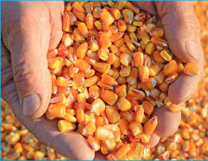
HIGHER FREQUENCY MEASUREMENT PENETRATES DEEPER INTO GRAIN