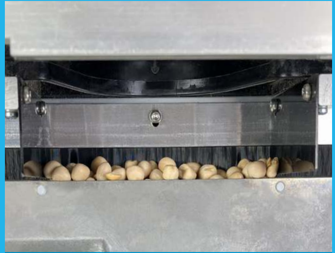
MINIMUM DEBRIS BUILD-UP FOR HIGH ACCURACY